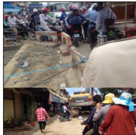
Figure 4: Roadblocks in Phnom Penh

The biggest challenge for delivery drivers is when they cannot connect with the purchaser on the phone. To offset this problem, the drivers carry multiple phones (or, with one driver, multiple SIM cards.) One of our informants explained that sometimes calls are dropped between carriers and trying with another carrier will allow them to connect. One delivery manager explains, “If the network is busy or you can't contact, we send a text, saying, hey we are from the delivery company, we arrived, you didn't pick up. Then, to save our butt, we call the store right away, we explain that we called this person they didn't pick up, blah blah. Then when they call the store, we already saved our butt.”