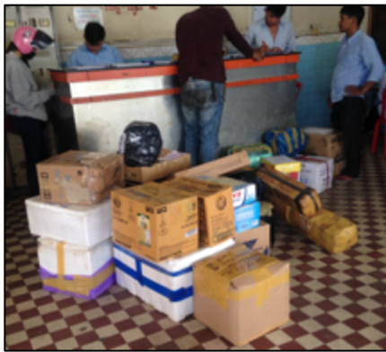
Figure 5: Goods piled at bus station for transport

To deliver to the provinces, the delivery drivers coordinate either with a taxi line or with the public bus service. They typically drop off goods at the public bus station in the city center, near the Central Market. The delivery driver drops the goods with the person who runs the ticket counter, who then gives the goods to the bus driver to load into the bus (see Figure 5). Then the bus driver transports goods to the closest bus station to the consumer on his normal route. The customers then either pick up the product at the bus station or another taxi drives the product to their homes. Sometimes consumers live in such a remote locations that the only way to get products to them from Phnom Penh is by taxi. During these exchanges, the package is labeled with the telephone number of the consumer and the selling store as well as the location of the exchange. Whenever products are sold remotely in the provinces, customers pay upfront using Wing or another mobile money platform.