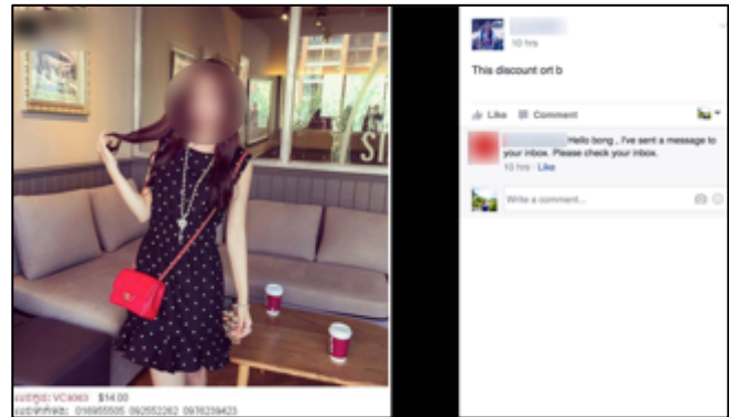
Figure 1: "Small Clothes Shop" Facebook post

pioneer in Facebook buying and selling. The shop sells mid-priced fashion for men and women, targeted at young people in their teens through twenties. Most of the products are imported in bulk from China. Two Cambodian brothers own the shop, one of whom manages the business and works on the shop premises. He is familiar with staff workflow and has helped establish good practices with the input of the drivers and call center staff.