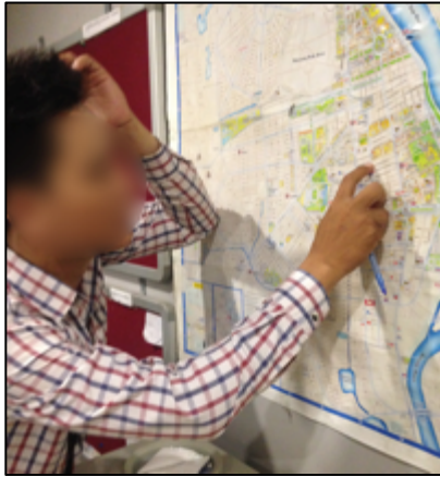
Figure 3: Driver looking at map

certain price threshold (usually about $50) has been reached, at which time they offer delivery for free. We interviewed the delivery drivers at five shops and accompanied two delivery drivers on their routes in order to better understand the challenges they face and the way they coordinate their jobs.